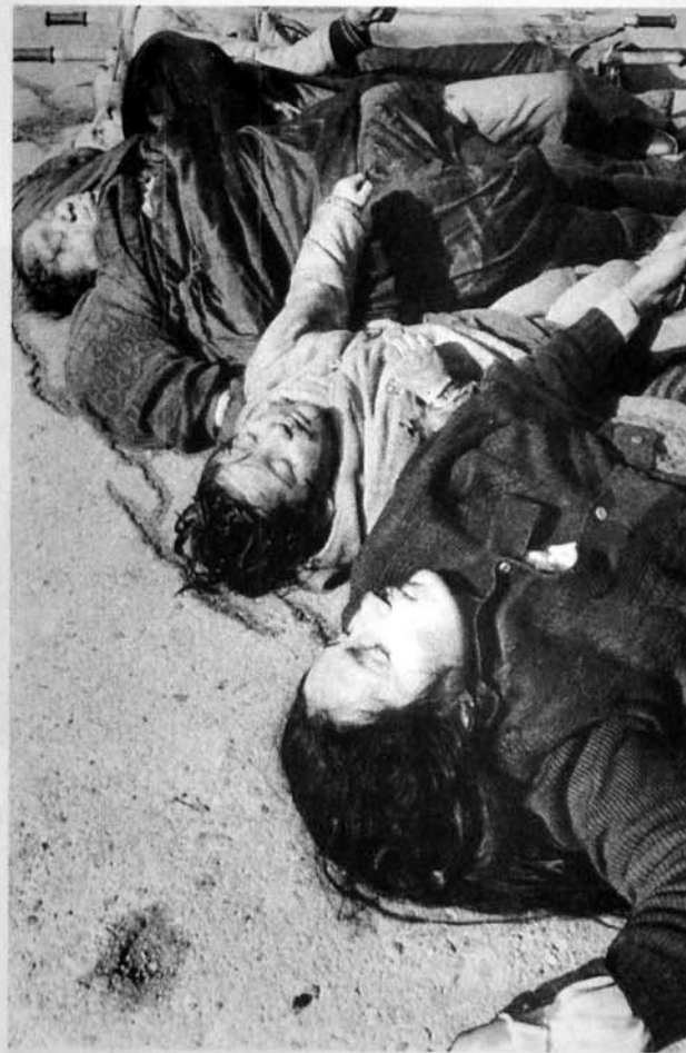
Victims of the Armenian terrorism in Khojaly

Today, on 26 February 2012, on 20th anniversary of this tragedy we with deep sorrow pray for Khojaly shahids (613 killed including corpses of those whom Armenians maimed so that it's impossible to identify them and more than 1000 persons who are missed and also considered as killed). We pray Allah for them and once again want to try to persuade all their nearest and dearest and also all Azerbaijani people that truth will triumph over and ideas that Khojaly shahids fought for will live for ever in free and independent Azerbaijan Republic.