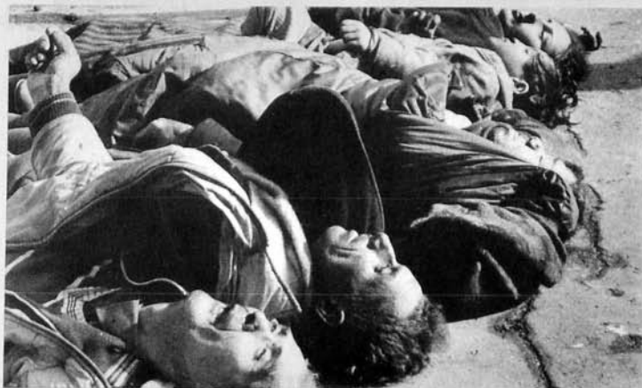
Azerbaijanis exposed to chemical weapon in Khojaly