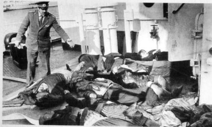
A crime committed by the Armenian terrorist organization "ASALA"