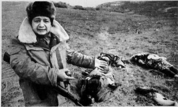
KHOJALY: a family subjected to the Armenian terror